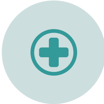
HEALTH AND SAFETY