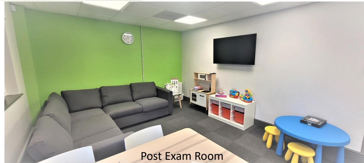
Post Exam Room