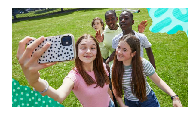
Age 9 to 13