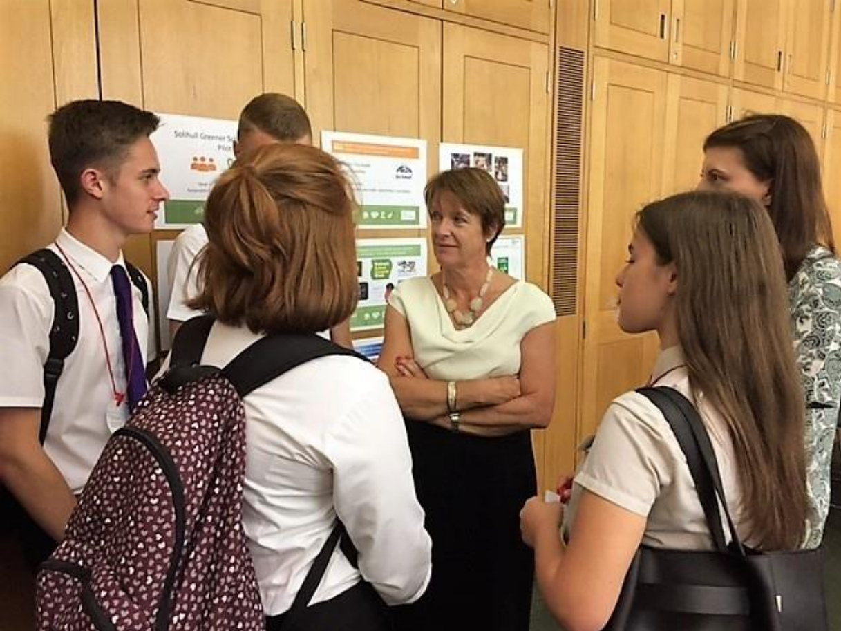
Grace Academy students meeting with Dame Caroline Spelman, MP

2018 ICN National Summit at Portcullis House, Westminster