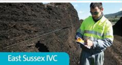
East Sussex IVC