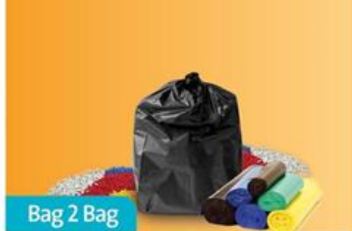
Bag 2 Bag