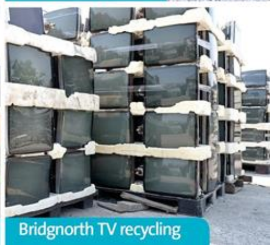
Bridgnorth TV recycling