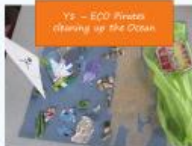
Y5 – Eco Pirates cleaning up the Ocean