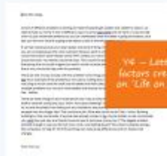
Y4 – Letter highlighting the factors creating the problems on 'Life on Land' and solutions