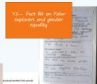
Y2 – Fact file on Polar explorers and gender equality