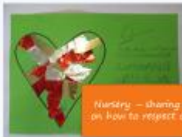
Nursery – sharing ideas on how to respect others