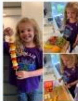
Reception – Learning about healthy eating whilst making, is fun!