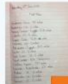
Y5 – 2 boys' views on Pro's and Con's with Universal access to WIFI

Each country has a goal that it wants to achieve by 2030. The goals are: Goal 1: No poverty, Goal 2: Zero hunger, Goal 3: Good health and well-being, Goal 4: Quality education, Goal 5: Gender equality, Goal 6: Clean water and sanitation, Goal 7: Affordable and clean energy, Goal 8: Decent work and economic growth, Goal 9: Industry, innovation and infrastructure, Goal 10: Reduced inequalities, Goal 11: Sustainable cities and communities, Goal 12: Responsible consumption and production, Goal 13: Climate action, Goal 14: Life below water, Goal 15: Life on land, Goal 16: Peace, justice and strong institutions, Goal 17: Partnerships for the goals.