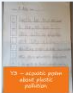
Y3 – acoustic poem about plastic pollution